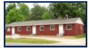
Our Post Home